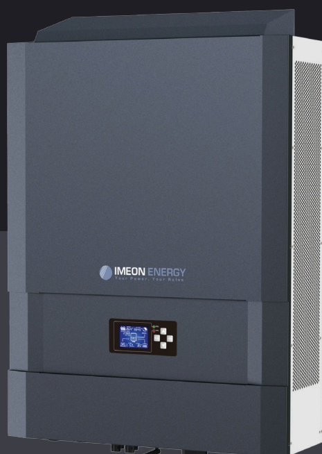
IMEON 9.12 Up to 12kWp Three phase