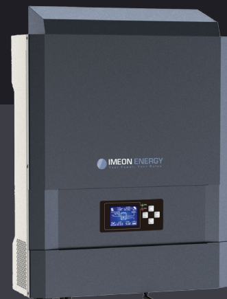
IMEON 3.6 Up to 4kWp Single phase